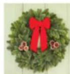
Wreath with red velvet bow, and 2 pine cone clusters