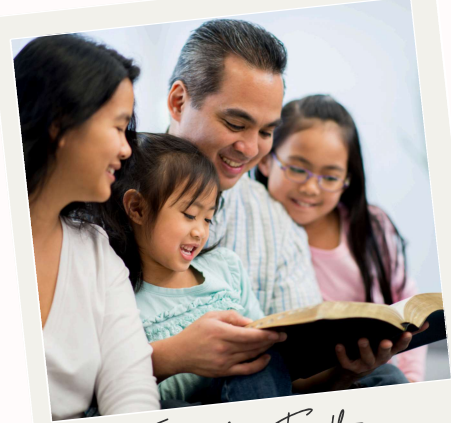
Teach the Faith